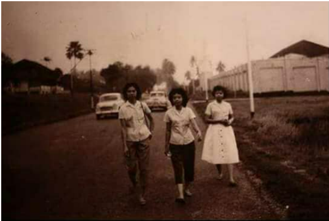
Jalan Hang Tuah in front of Pudu Jail circa 1937