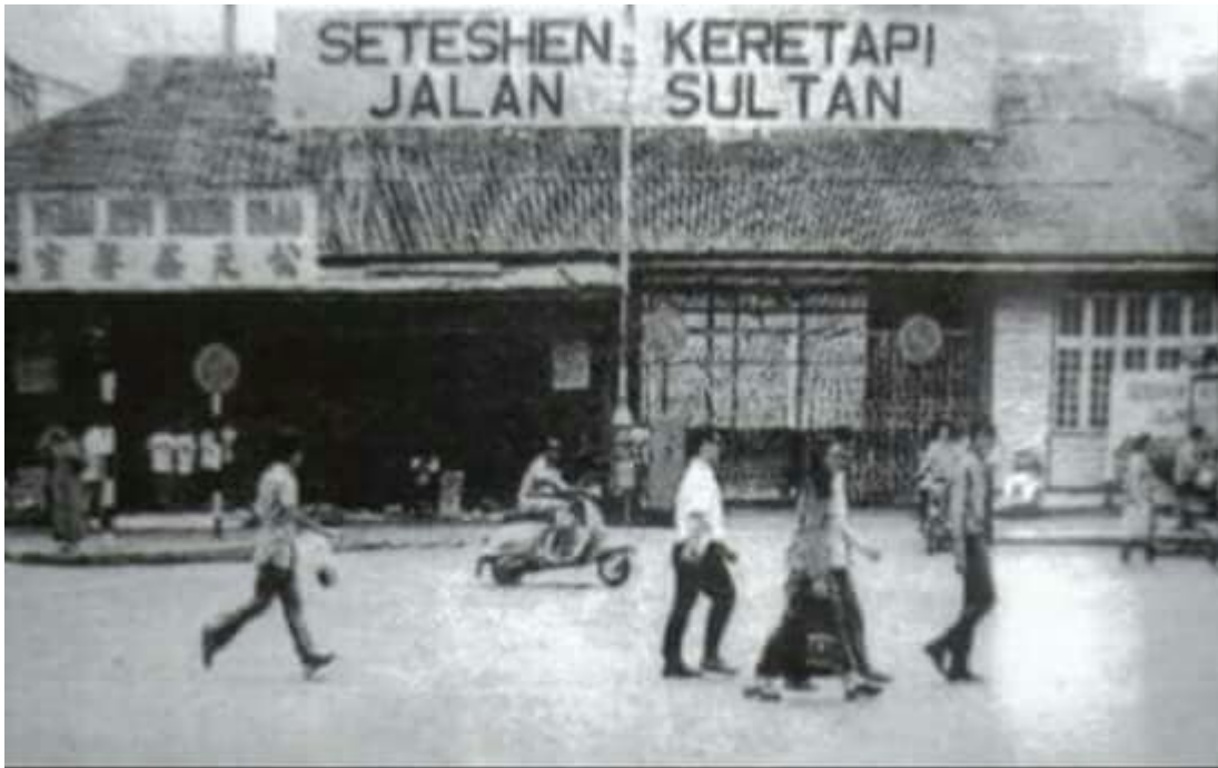
Jln Sultan Railway Station