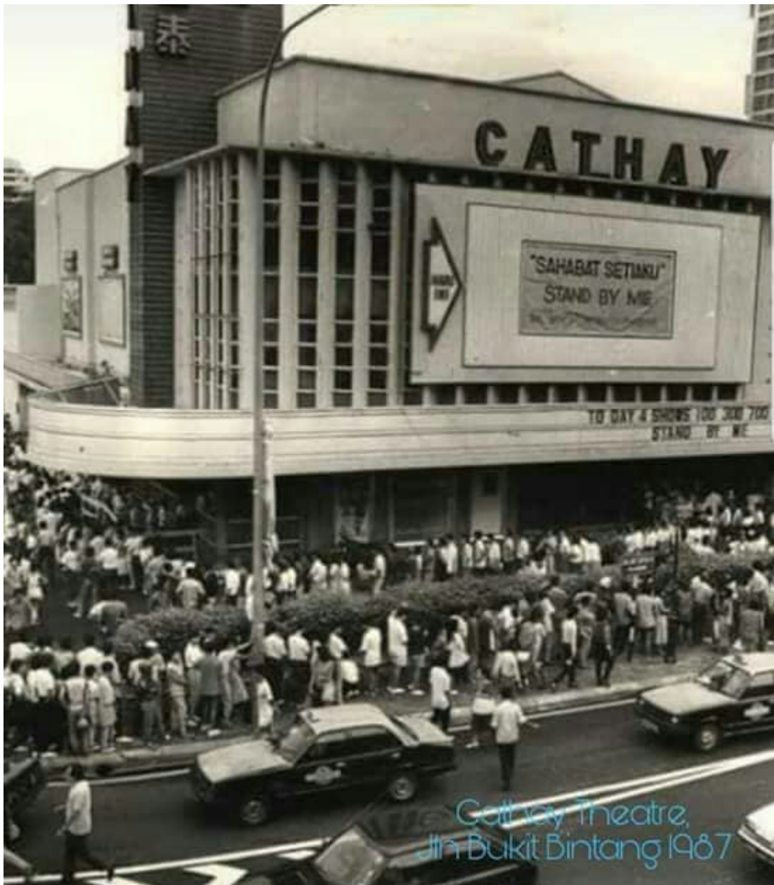
Cathay Theatre, Jln Bukit Bintang 1987