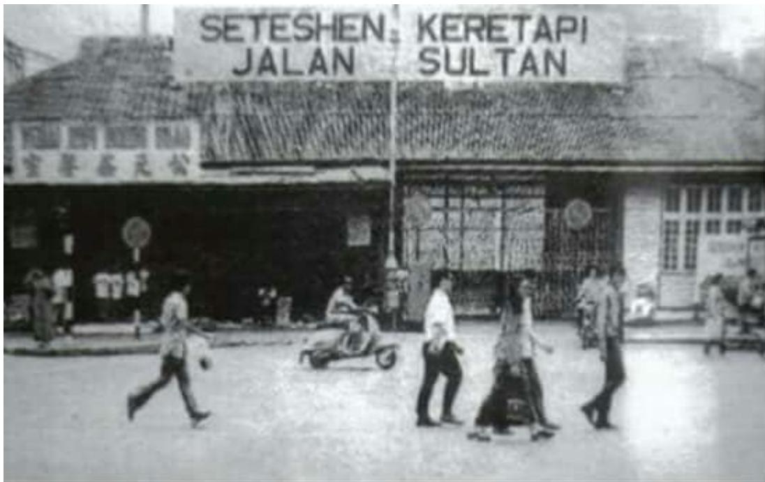
Jln Sultan Railway Station