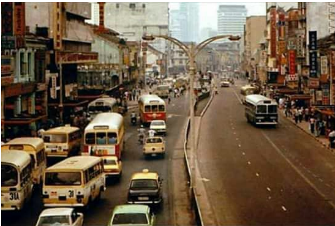
Chow Kit Area 1980s