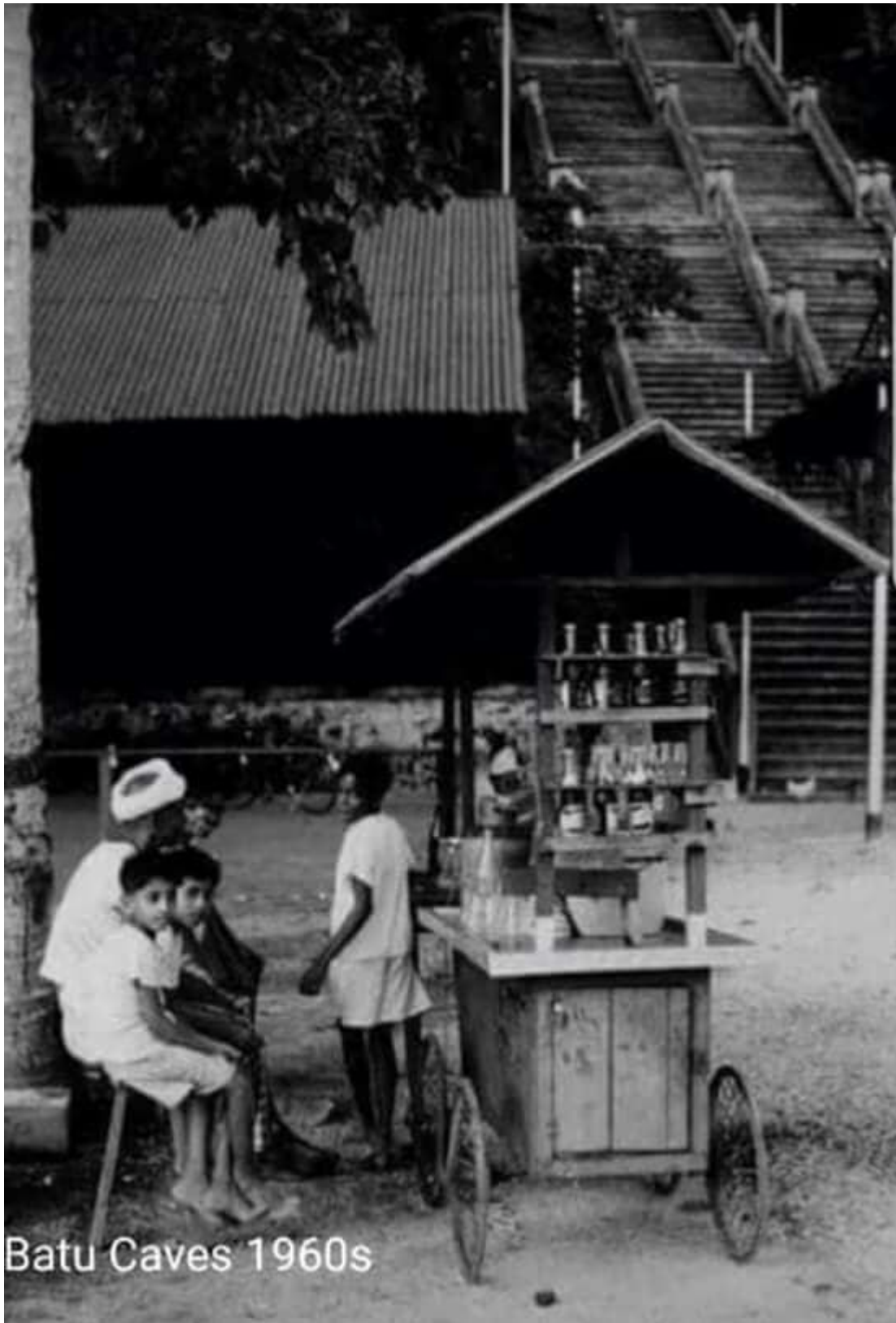
Batu Caves 1960s