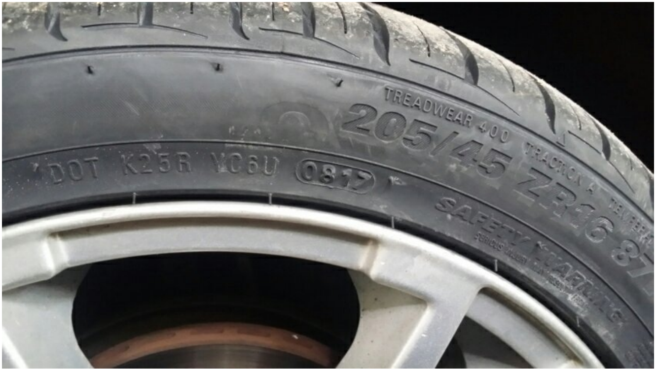
(0817) tarikh dikeluarkan