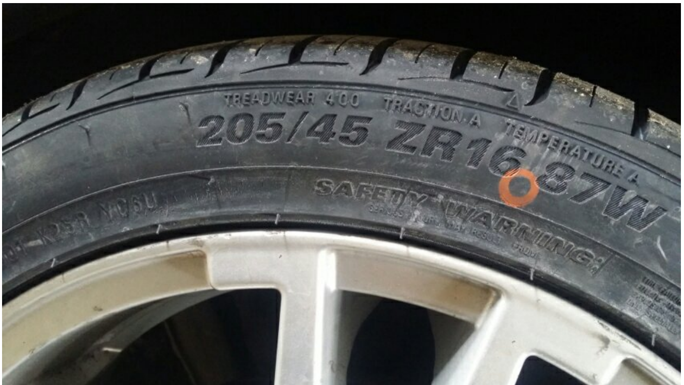
(????) Tarikh dikeluarkan